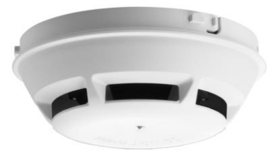
Model OP921 Photoelectric Smoke Detector

The smoke chamber is designed to manage light dissipation and extraneous reflections from dust particles or other non-smoke, airborne contaminants in such a way as to maintain stable, consistent detector operation. When smoke enters the detector chamber, light emitted from the IRLED is scattered by the smoke particles, and is received by the photodiode (see: the computer-graphic images on page 2).